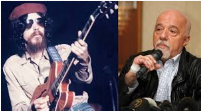
Paulo Coelho started out as a rock and roller with Raul Seixas