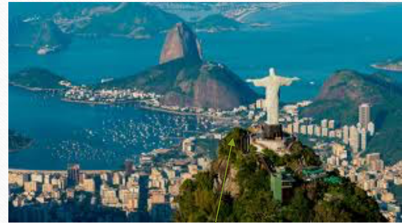
Christ the Redeemer statue