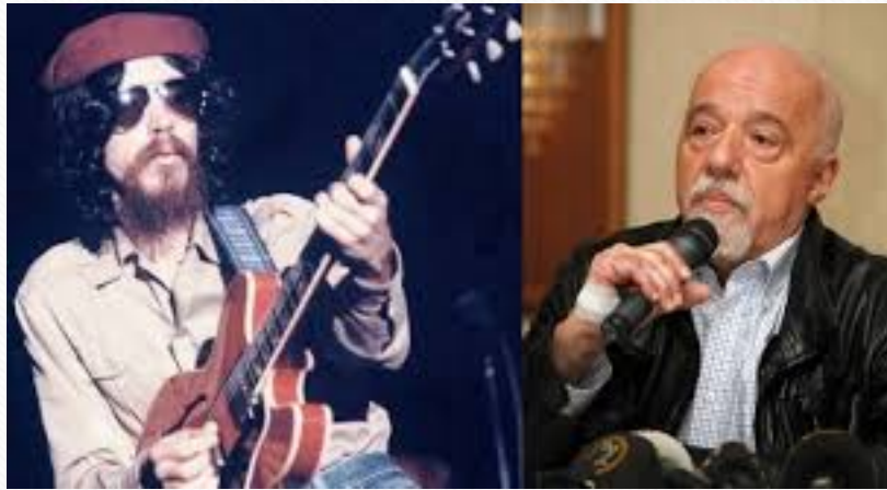
Paulo Coelho started out as a rock and roller with Raul Seixas